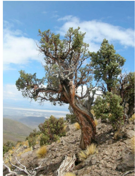
Ancient trees, such as Polylepis tarapacana in the Altiplano, are sensitive to large-scale climate patterns stemming from the El Niño-Southern Oscillation.