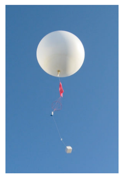
Weather balloon on its journey to the upper atmosphere. Launched once or twice a day from stations throughout the world, balloons are used to measure wind speed and direction up to 19 miles high.