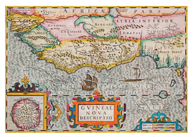
Antique Dutch map of Guinea Coast.

"We could not find any observational evidence that the changes are linked to a weakened Atlantic Meridional Over-