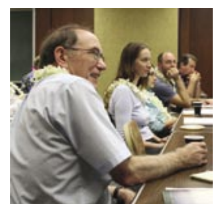
Lonnie Thompson during the workshop "Climatic Changes in the Last 1500 Years: Their Impact on Pacific Islands."

these climate shifts were widely debated during the workshop. Although changes in incoming solar radiation and volcanic eruptions are believed to have caused some past climate changes in the tropical Pacific, computer model solutions point to intrinsic climate variability and forcing from the Atlantic and the Indian Ocean as other important factors.